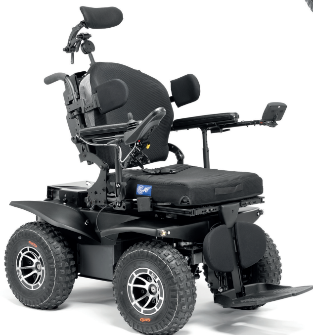
AMY seat (optional)