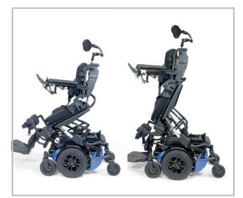
Programmed electronic module to switch from seated to upright position fluidly and safely.