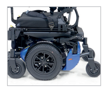
Median tension configuration and 6-wheel interactive suspension of wheels and seat for more stability, mobility and comfort.