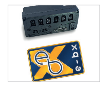
Mastery of intelligent cylinders and programming of the wheelchair.