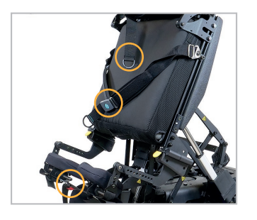
Chest belt, pelvic belt and knee supports for maximum support.