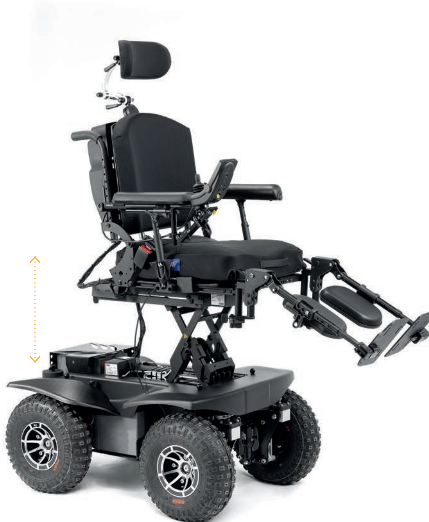
Electric seat lift 28 cm (AMY seat option)