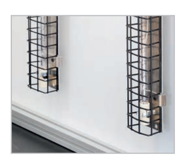
Lights are protected and have a 6000 hours of use life expectancy.