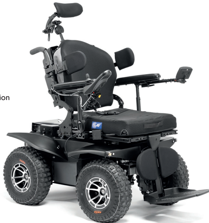
AMY seat option