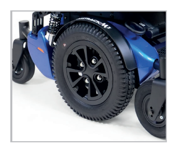
Median traction configuration.