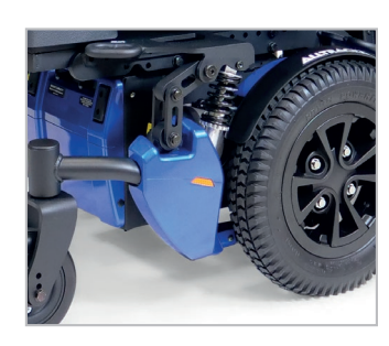
Interactive suspension for the 6 wheels and the seat provide greater stability, mobility and comfort.