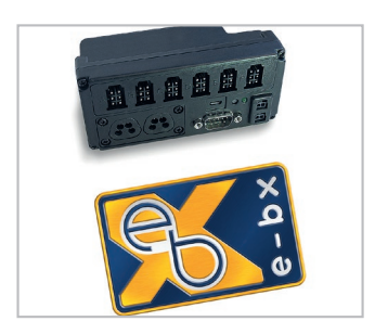
Mastery of intelligent cylinders and positional programming of the wheelchair.