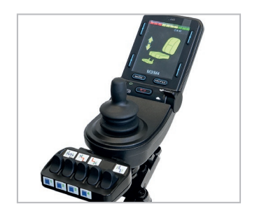
CJSM2 Joystick and keyboard (optional) to facilitate driving and secure the use of different positions.